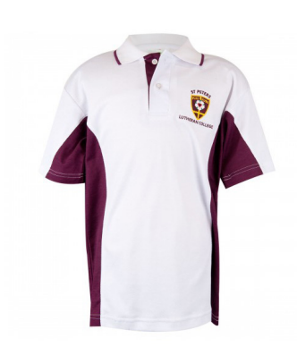
Short Sleeve White Polo