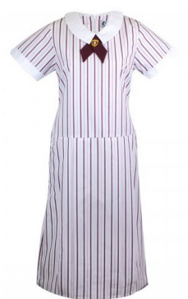
Girls Blouse & Shorts or Dress