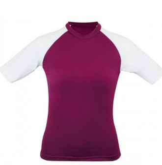
Cunningham House Polo & Hat