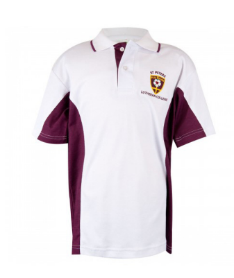
Short Sleeve White Polo