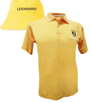
Leichhardt House Polo & Hat