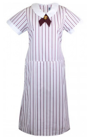
• Girls Blouse & Shorts or Dress