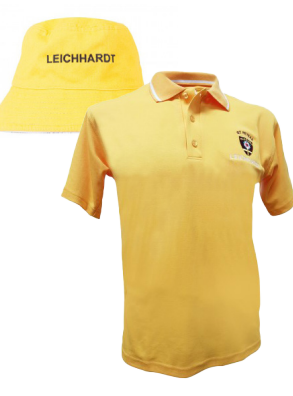
Leichhardt House Polo & Hat