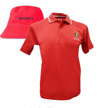
Mitchell House Polo & Hat