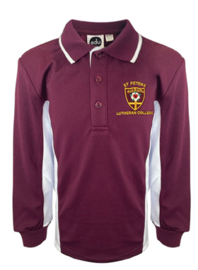
Long Sleeve Polo