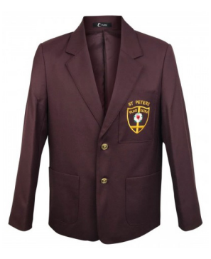
• Blazer - Year 6 only