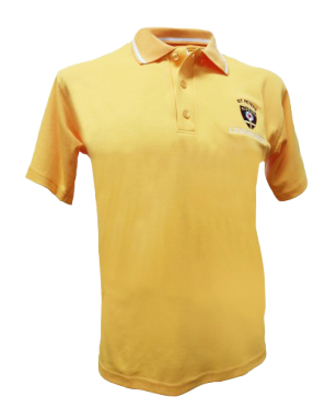
Leichhardt House Polo