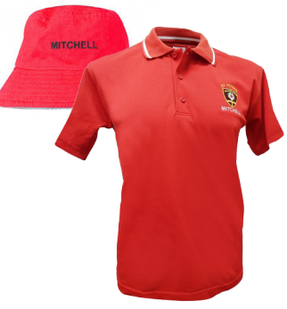
Mitchell House Polo & Hat