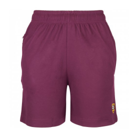
Cotton Back Sport Shorts