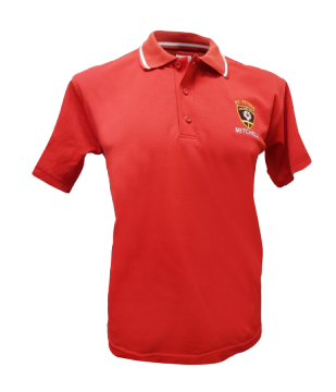
Mitchell House Polo