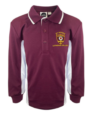
Long Sleeve Polo