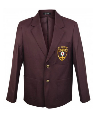
Boys or Girls Blazer