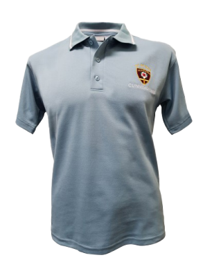
Cunningham House Polo