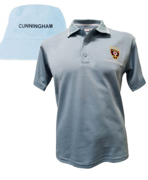
Cunningham House Polo & Hat