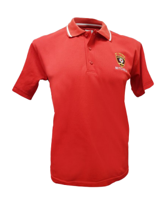
Mitchell House Polo