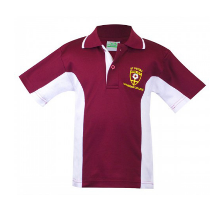
Short Sleeve Maroon Polo