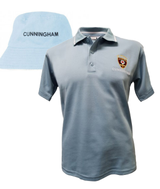
Cunningham House Polo & Hat