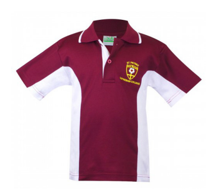
Short Sleeve Maroon Polo